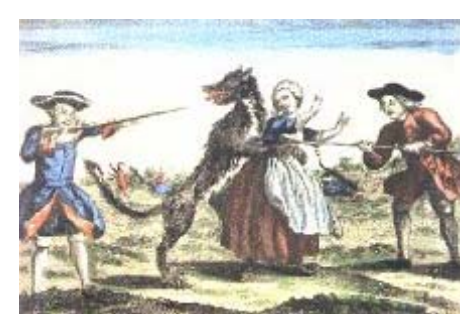
THE BEAST OF GEVAUDAN

That plague was a most unusual phenomena and it was called The Beast of Gévaudan. This true monster prowled the frenzied the region of Auvergne and South Dordogne during the years 1764 to 1767, killing no less than One Hundred people, often in bizarre and terrifying circumstances.