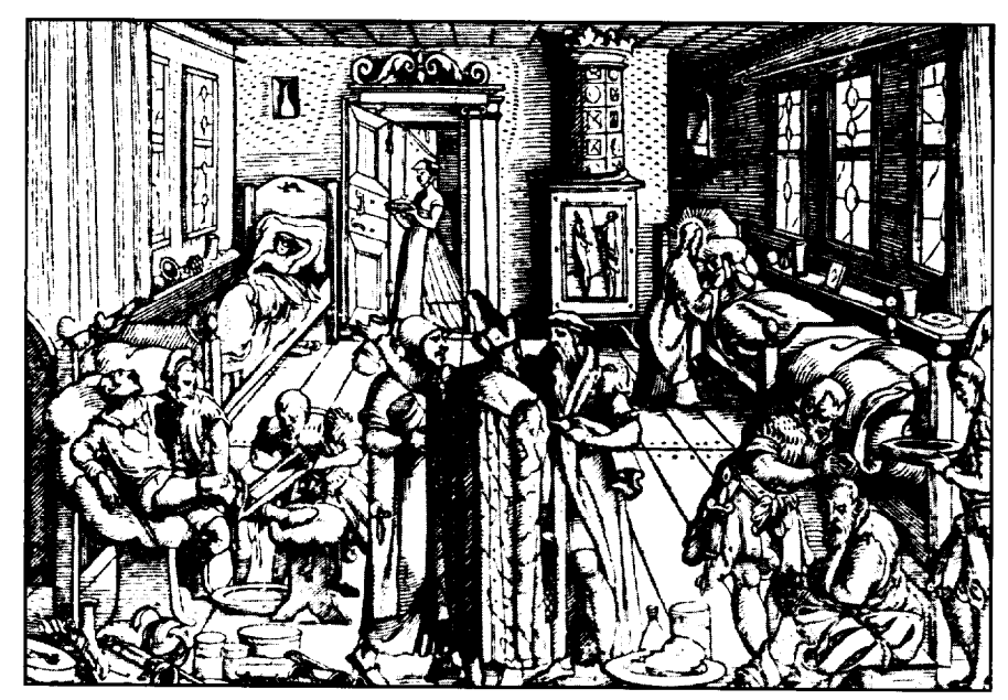
Renaissance surgical scene. From Paracelsus, Opus chyrurgicum . . . und Artzney Buch (Franckfurt am Mayn, 1565)

challenge to the educational establishment and its reliance on ancient authorities. Some Paracelsians took pride in the fact that they had not gone to the universities at all, thus avoiding the useless knowledge they would have been subjected to. Those who did not go to the universities turned instead to the two-book theory-reliance on Holy Scripture and on personal observations and experience. Here they found chemistry particularly valuable since it separated pure from impure. Beyond this, chemistry became a basis for explaining both macrocosmic and microcosmic phenomena. Even the Creator was pictured as a divine alchemist in commentaries on the first chapter of Genesis.