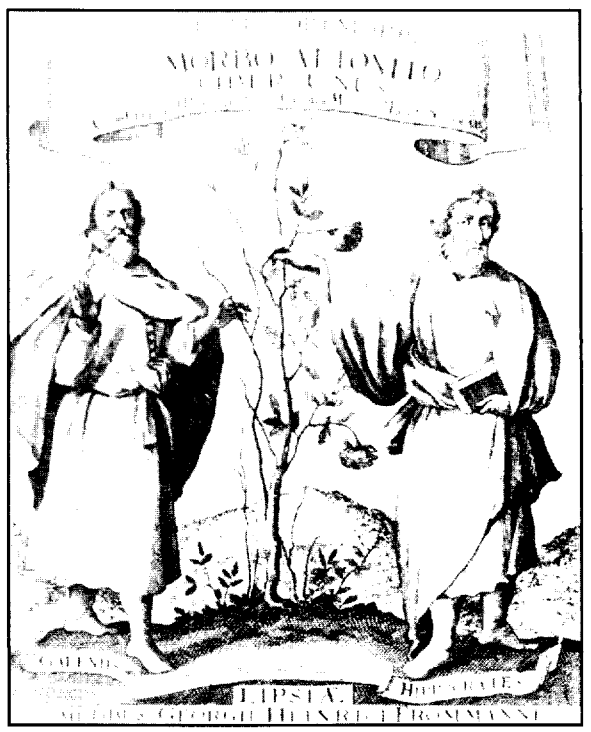
Numerous Renaissance physicians favored the teachings of Hippocrates over those of Galen. From Justi Cortnummii, Di morbo attonito liber unus ad Hippocraticam ... (Lipsiae, 1677)

A.D. Indeed, for many humanists the discovery of new texts seemed as exciting as the discovery of the new lands being made by contemporary explorers. The result was a new reliance on the truths of antiquity and establishment medicine became increasingly dependent upon the writings of Galen, the "Prince of Physicians." In short, with the corrected translations of ancient