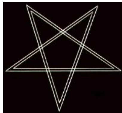
Upside-down (Evil ruling)